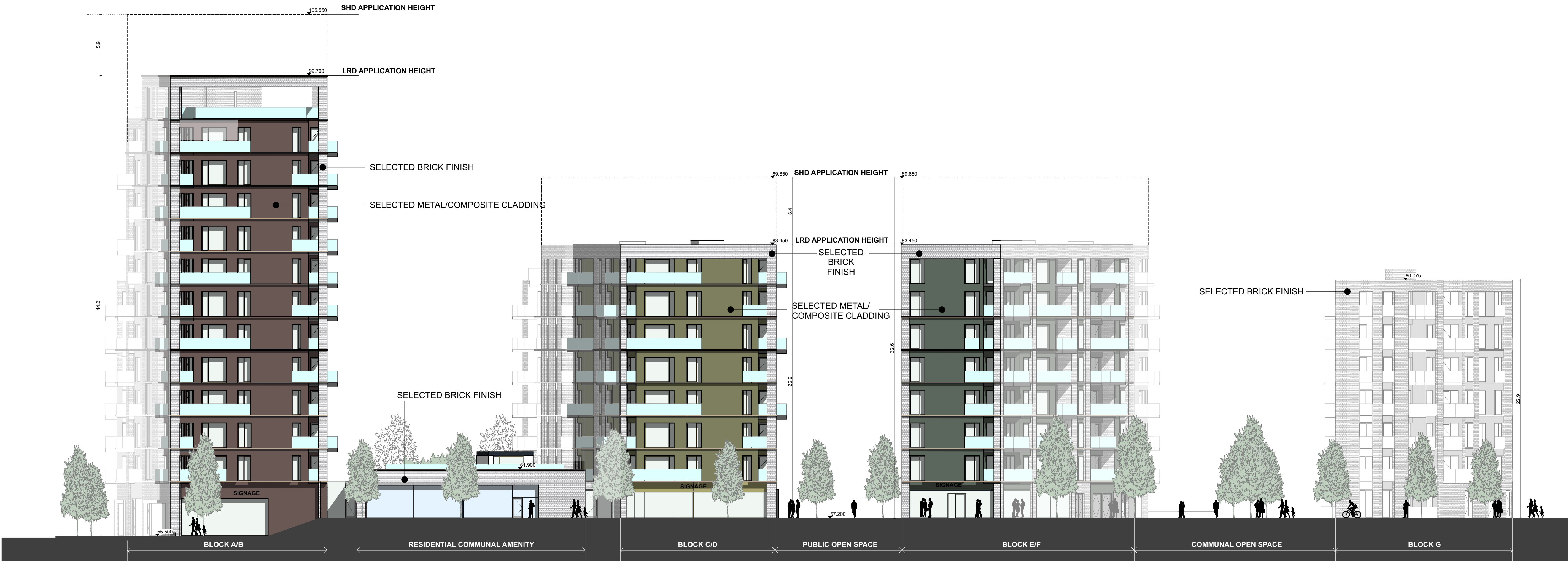
North Elevation SCALE : 1:200